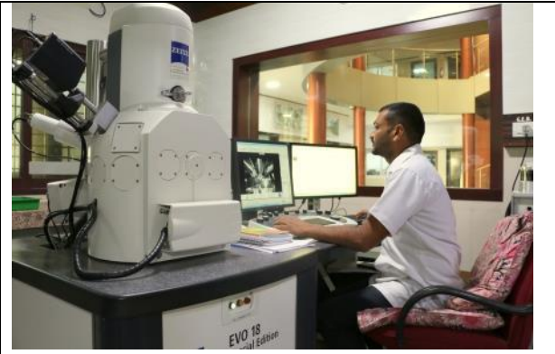
Food related microbiological analysis at FTL