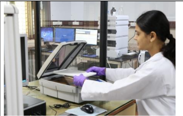
2-D and proteomic analysis at FTL