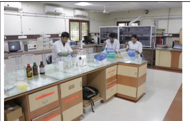
Quality parameters analysis of plant produces at FTL