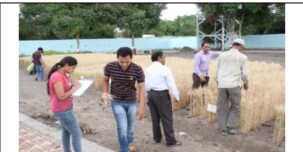
NPK Nanofertilizer field experiment by JAU- Biotech