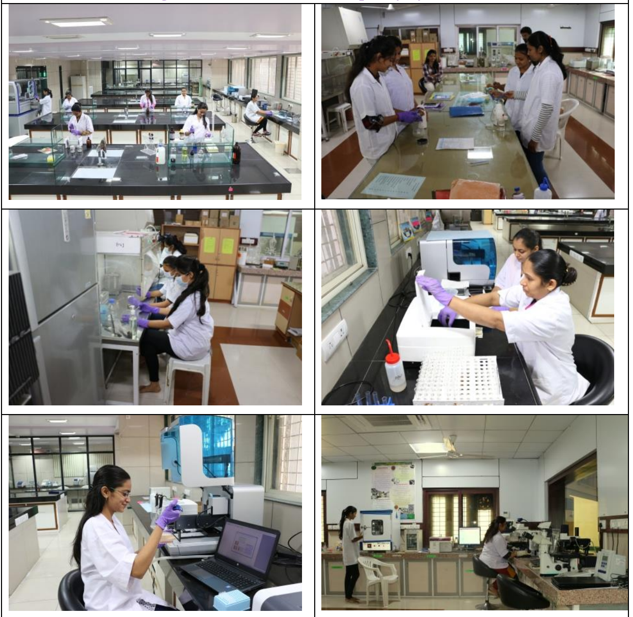
P.G. Research work and Student's training at JAU - Biotech